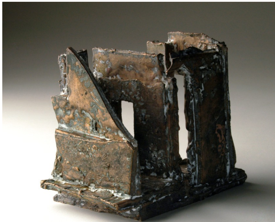
Vestiges I. 2008. Bronze 14,5 x 8,5 x 12 cm