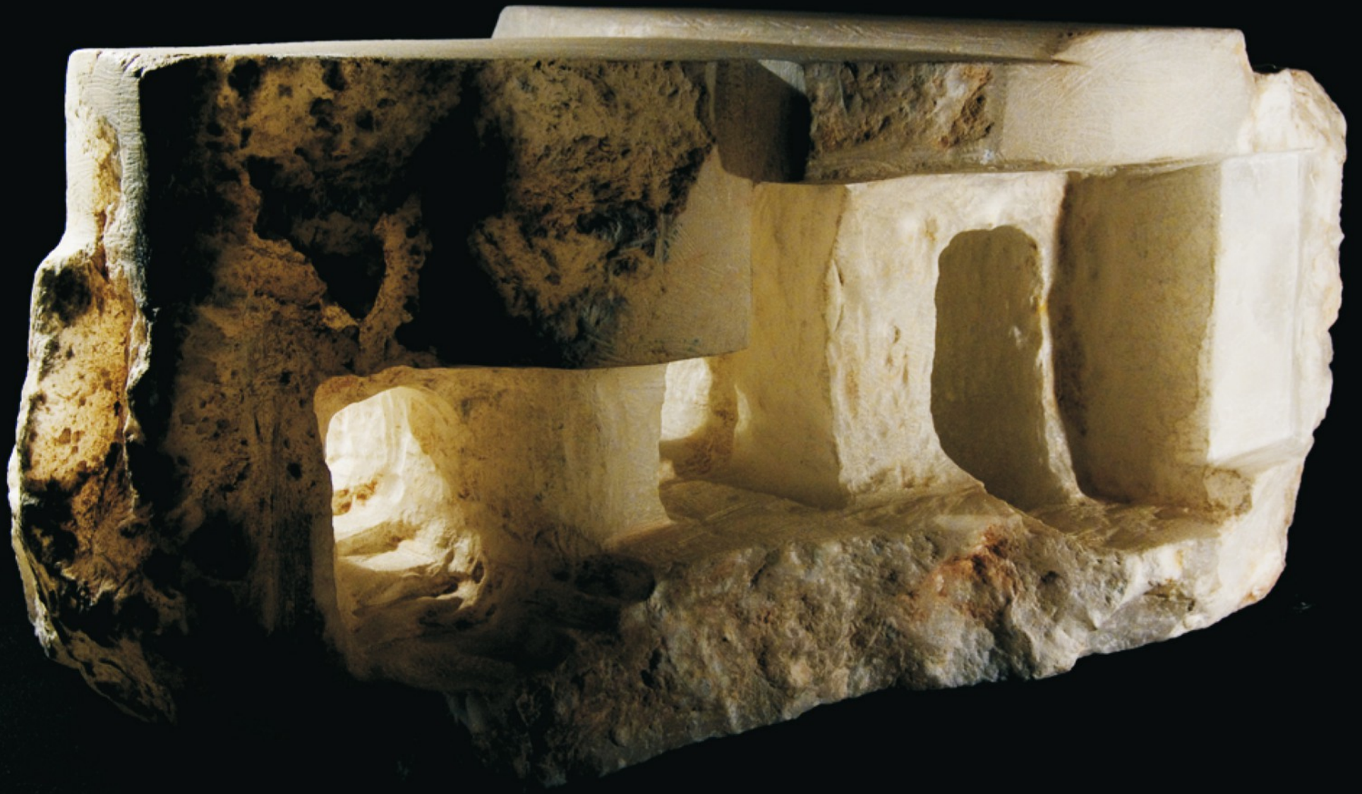
Estancias. 2001. Alabastro 43 x 39 x 21,2 cm