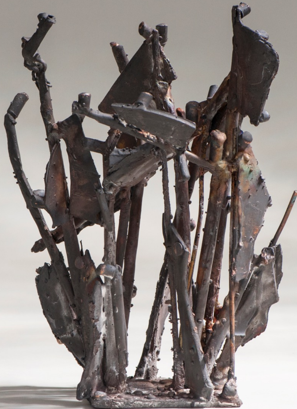
Amazonas II. 2016. Bronze 16 x 20 x 26,5