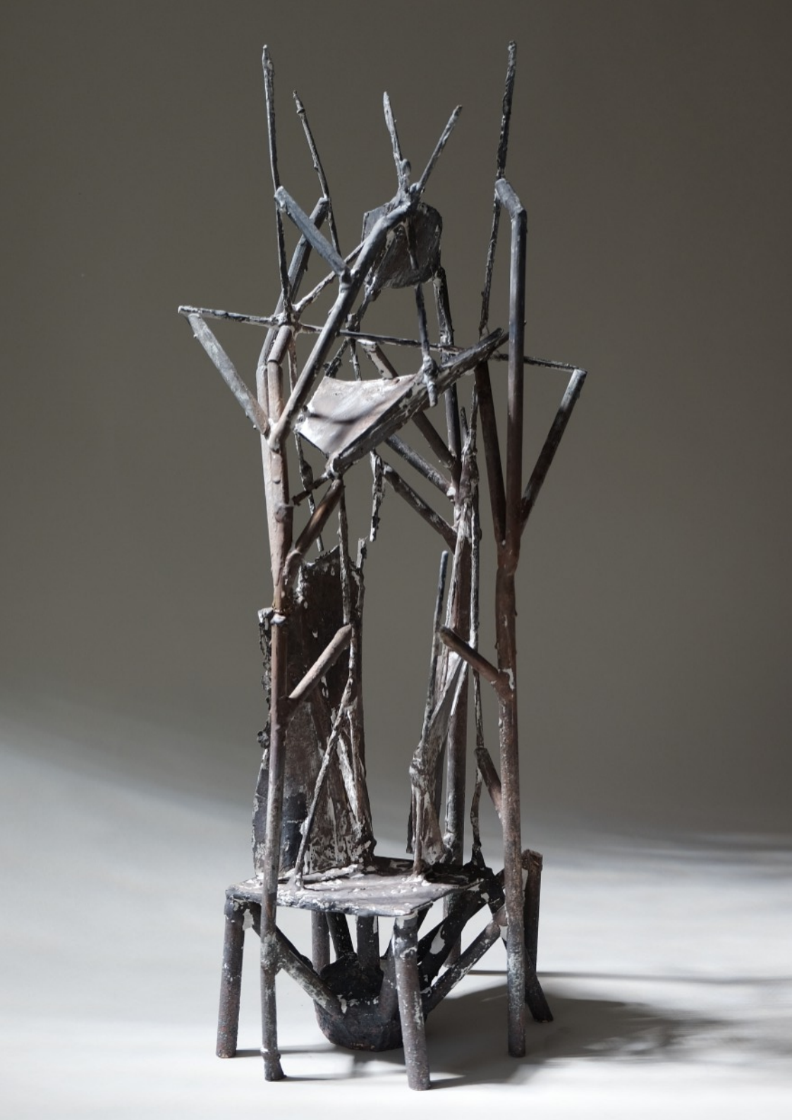
Vuelos II. 2017 Bronce 22 x 16 x 58 cm