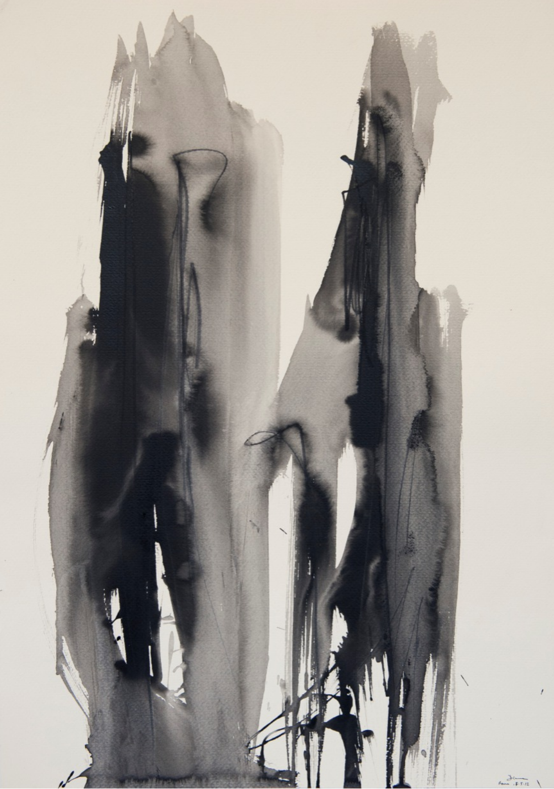
S/T, 2012 Tinta sobre papel 93 x 67 cm