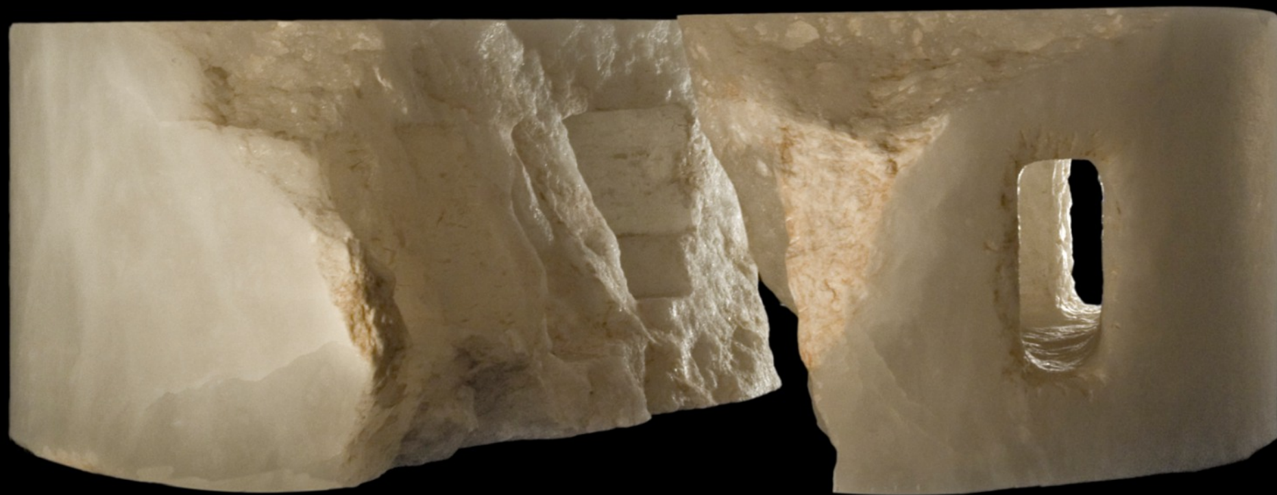
Circular. 2008. Alabastro 55 x 44 x 22 cm