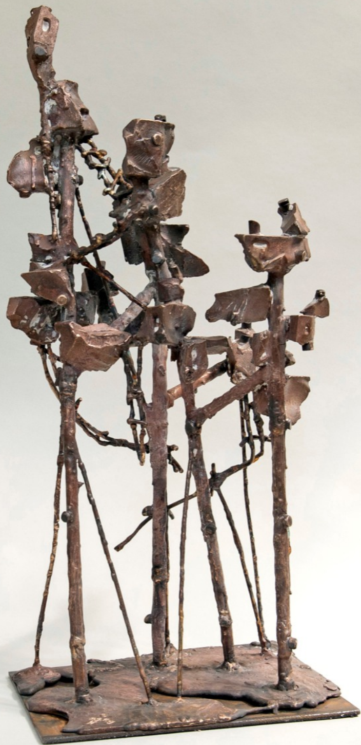
Ciudad aérea II. 2014. Bronce 17 x 23 x 52 cm