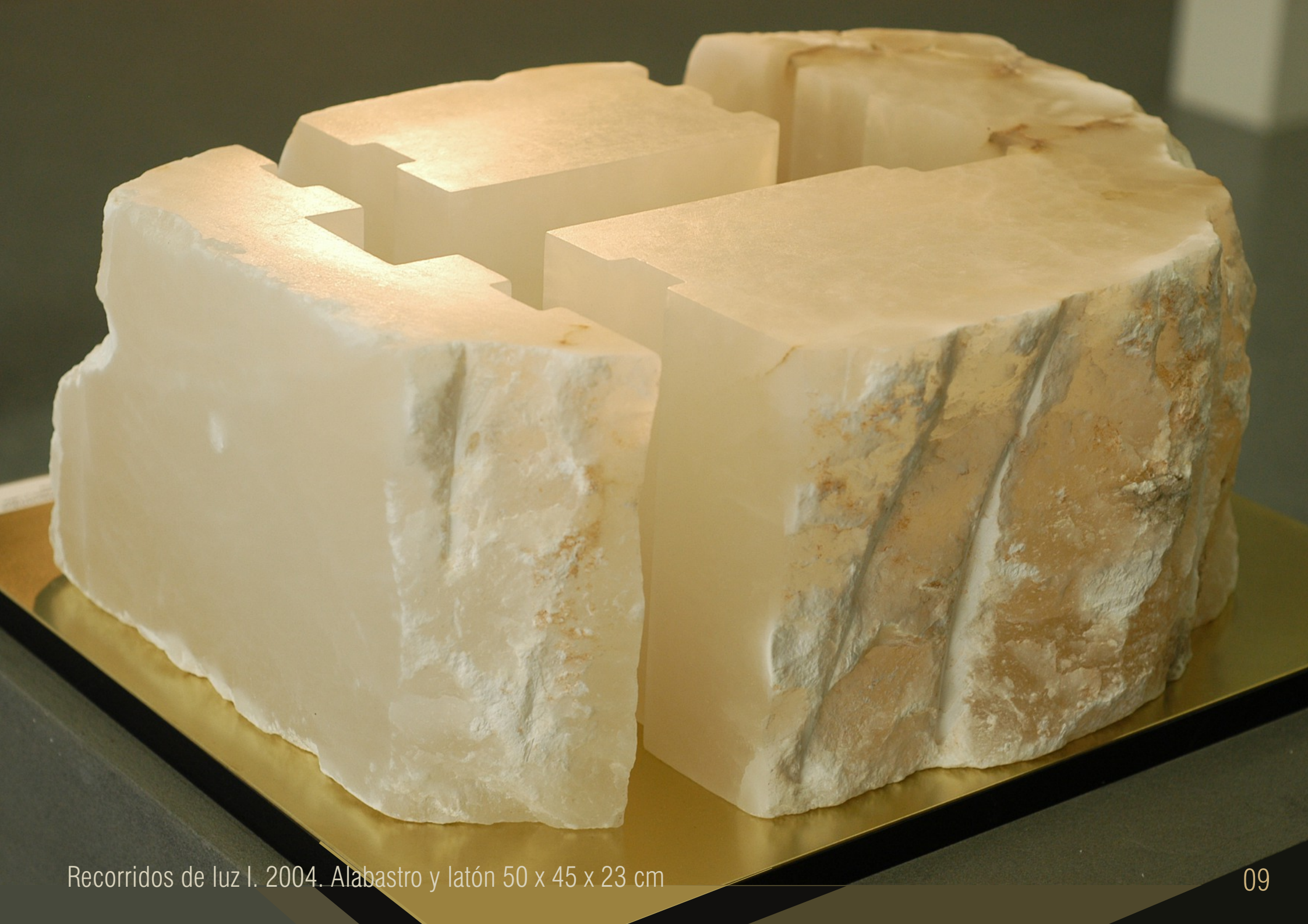
Recorridos de luz I. 2004. Alabastro y latón 50 x 45 x 23 cm