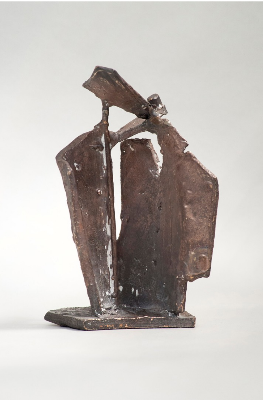
Puertas I. 2014. Bronce 10 x 8 x 17 cm