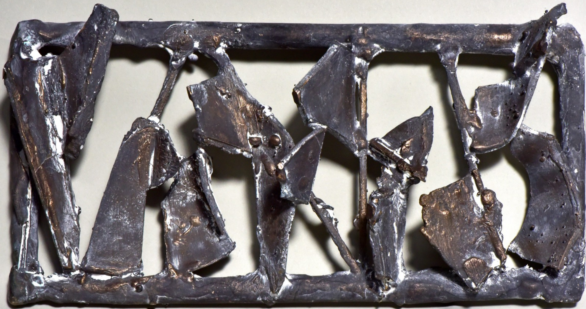
Relieve I. 2017 Bronze 24,5 x 4,5 x 12 cm