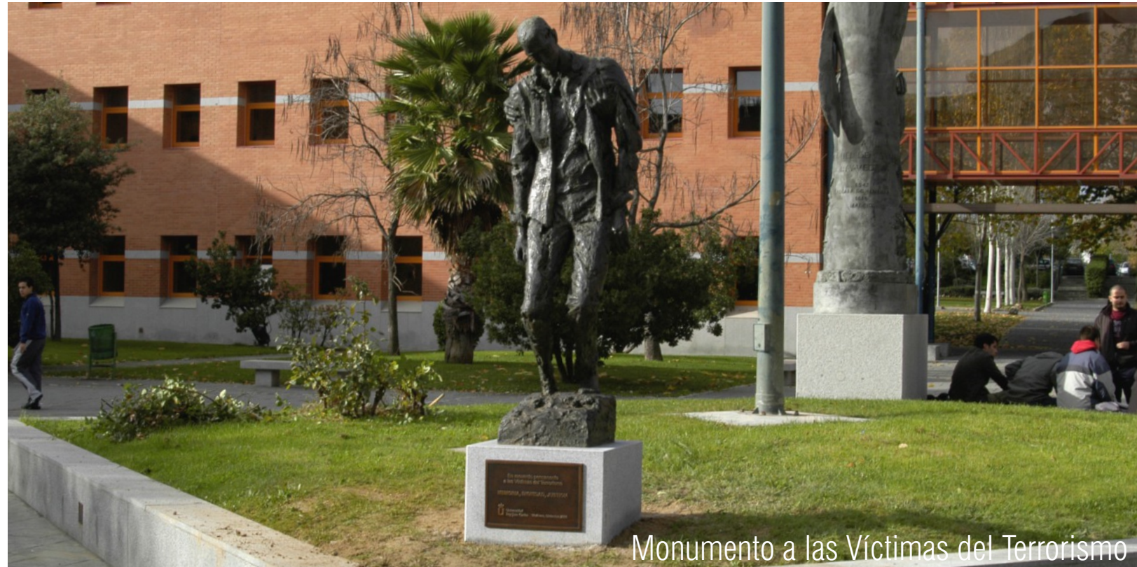
Monumento a las Víctimas del Terrorismo