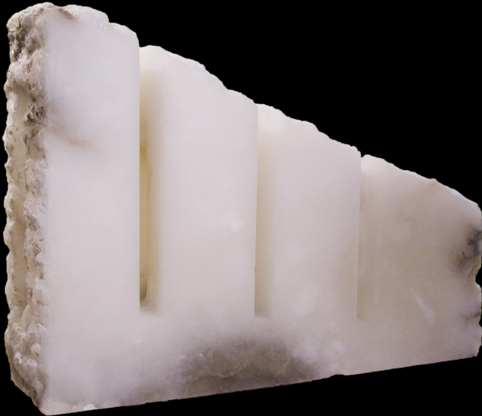
Sucesión. 2008. Alabastro 38 x 15,5 x 53 cm