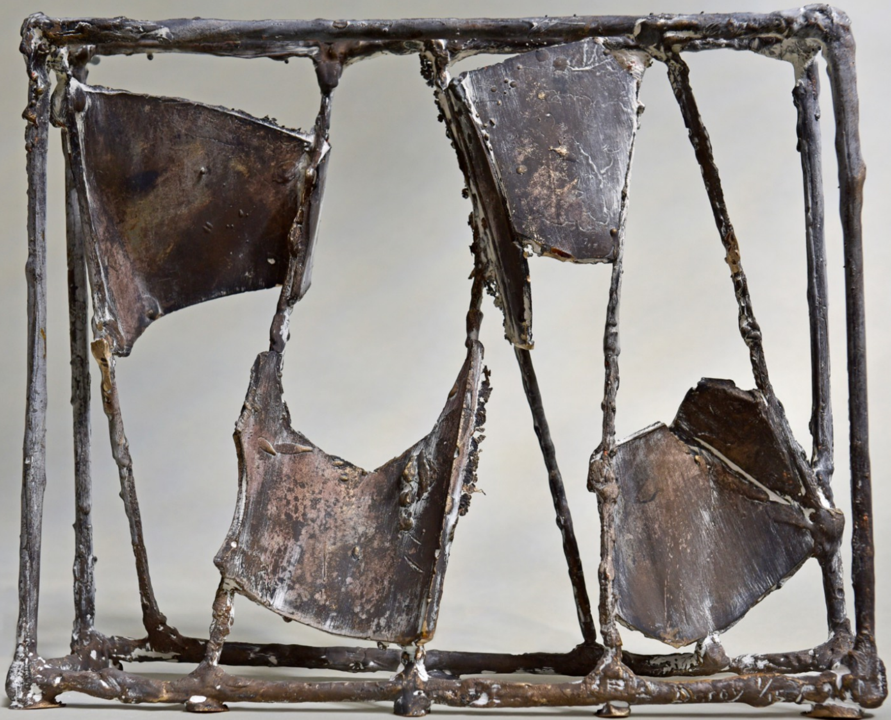
Relieve IV. 2017 Bronze 26,5 x 6,5 x 21,5 cm