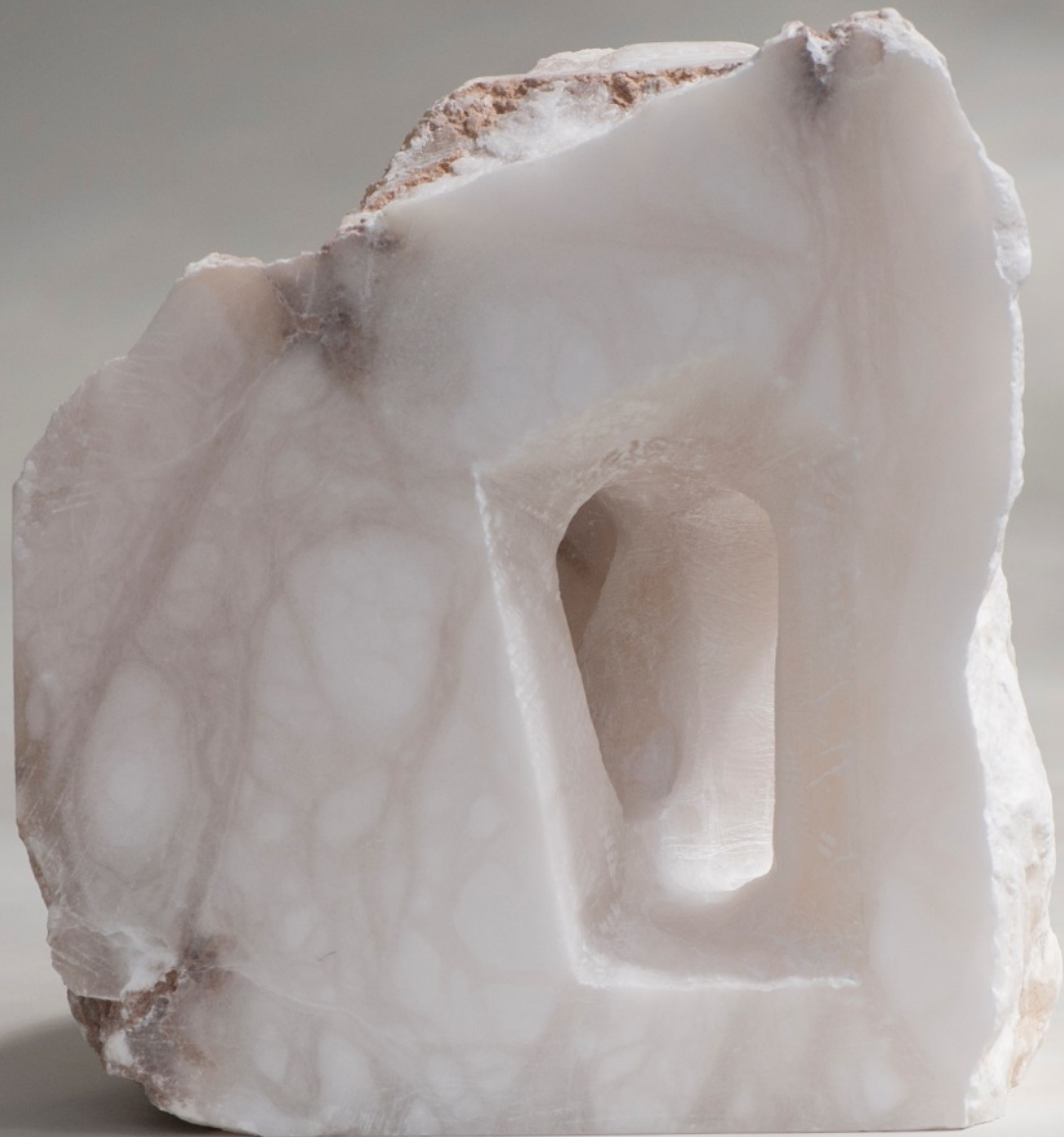
Encuentro. 2016 Alabastro 23 x 19,2 x 24 cm