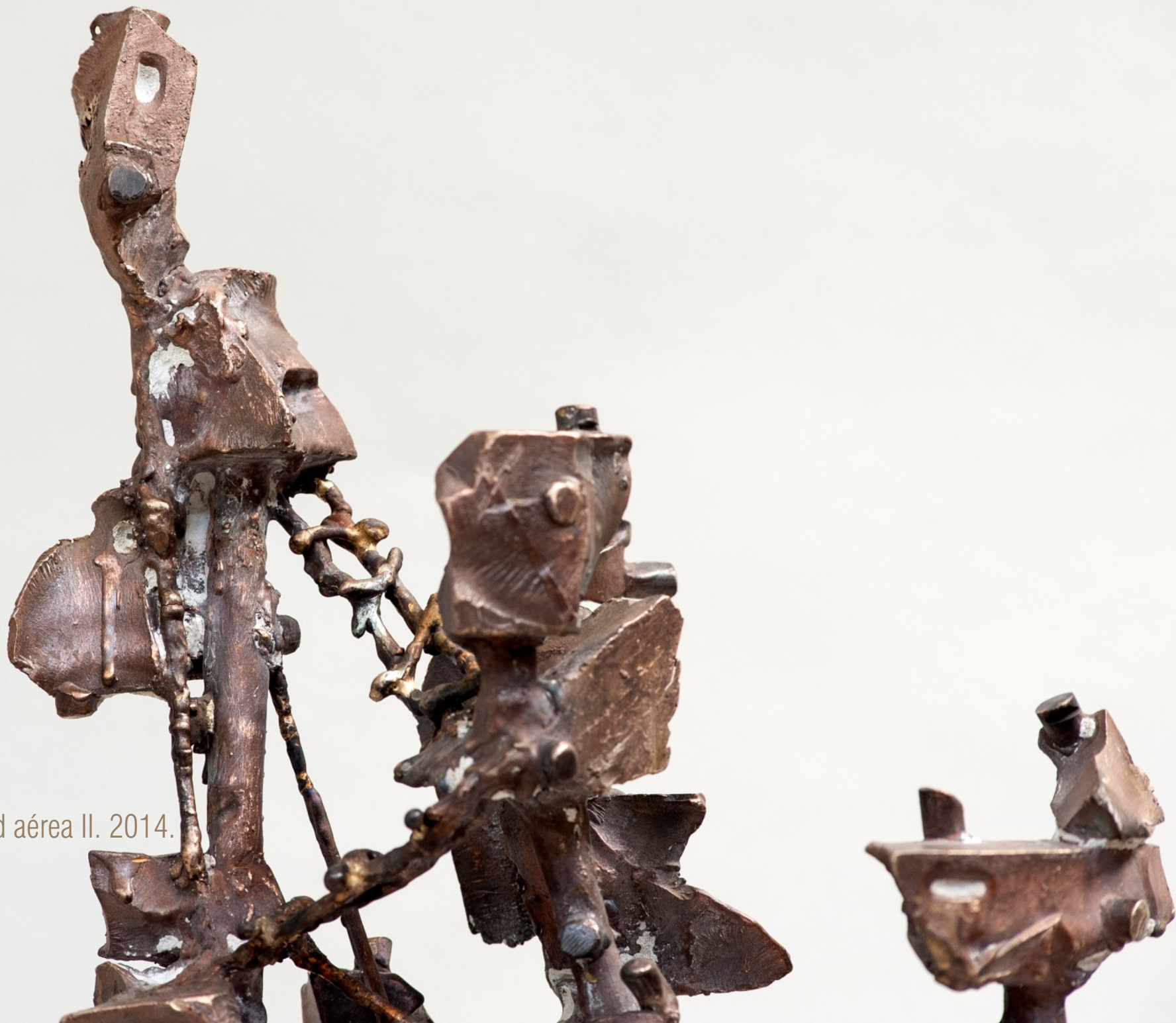
Detalle. Ciudad aérea II. 2014.