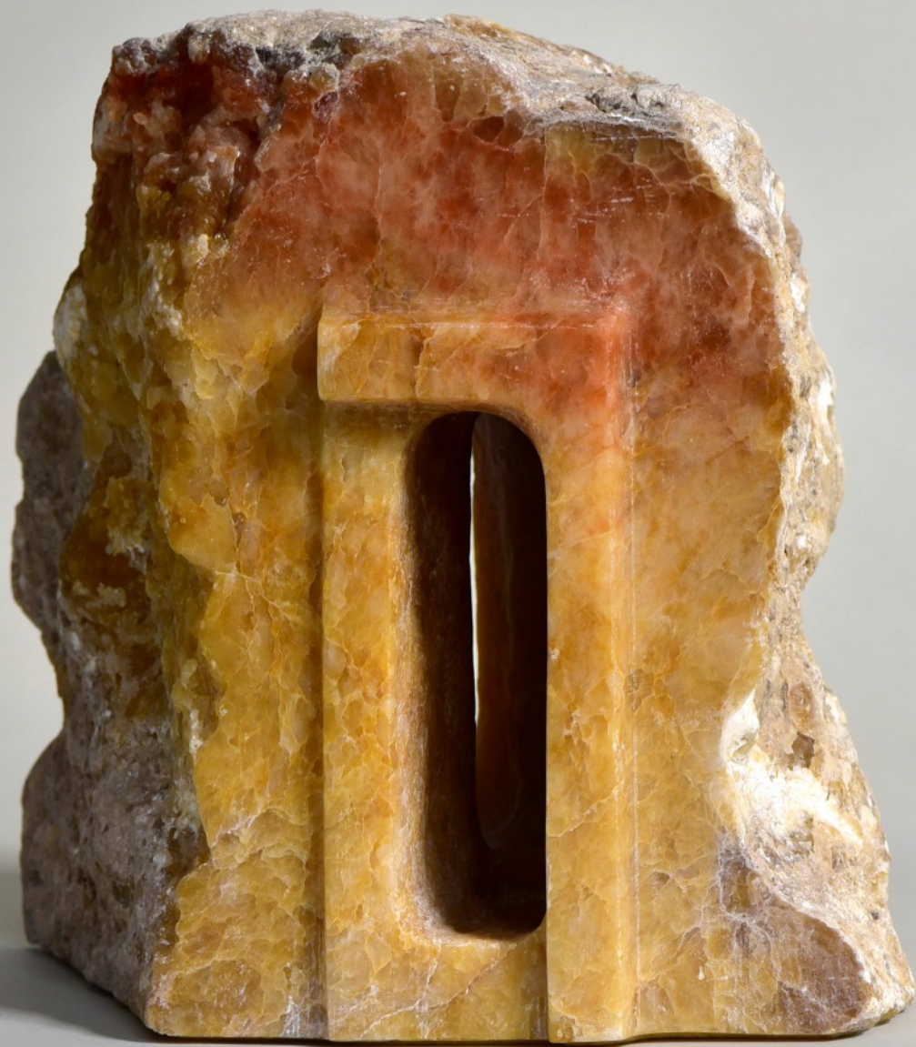
Pasaje. 2016 Alabastro 23,5 x 17 x 23 cm