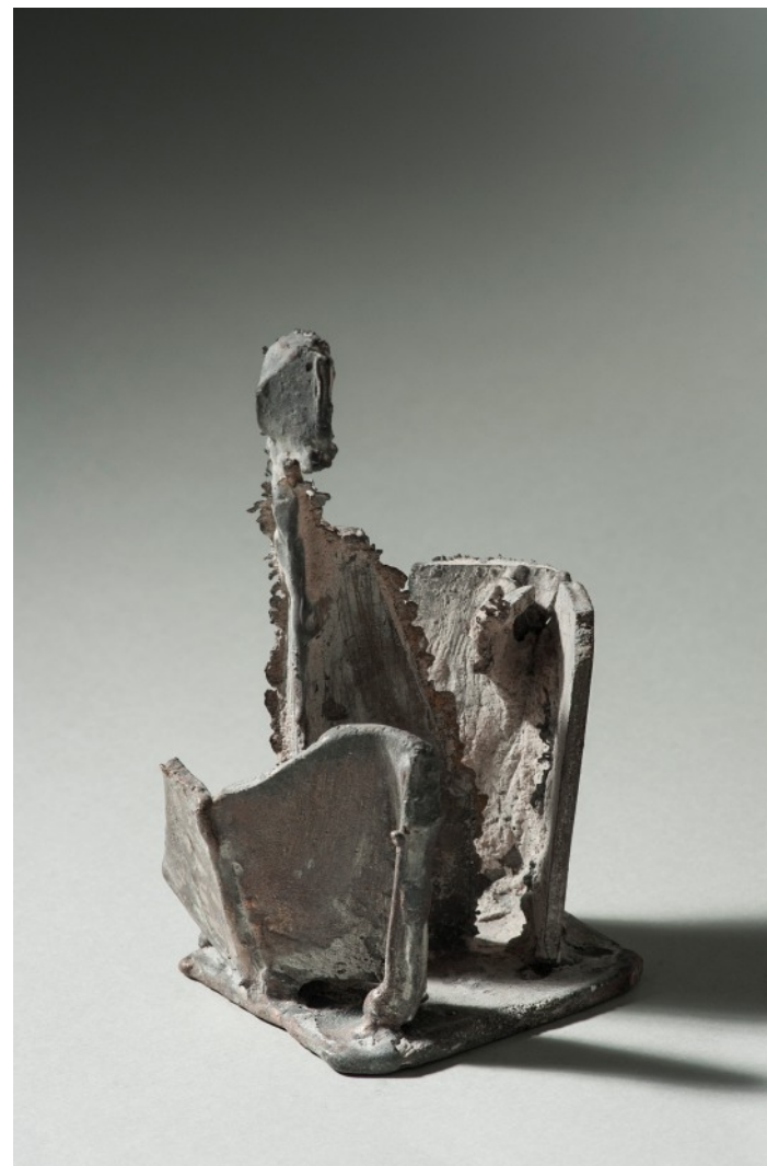
Passaggi IV. 2011. Bronze 9,5 x 8,5 x 15,5 cm