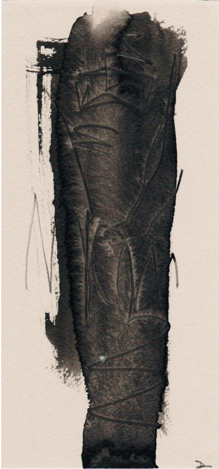
Pasadizo 2012 Tinta sobre papel 9,5 x 21 cm