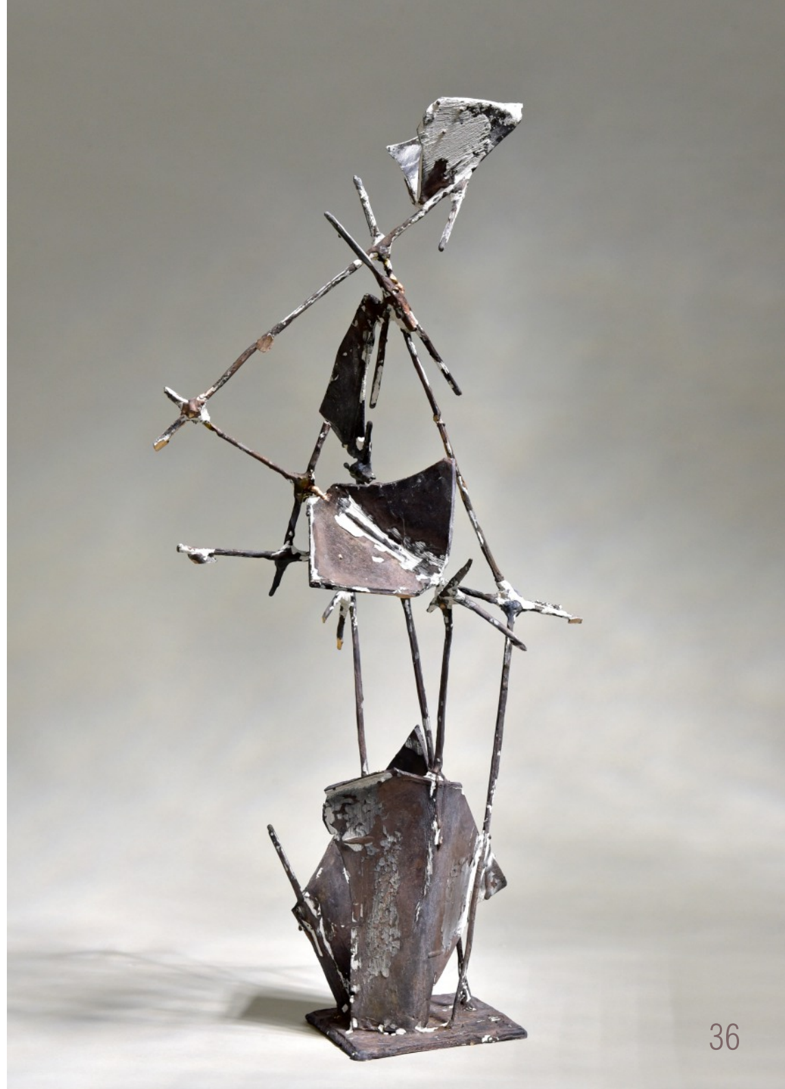
Vuelos I. 2017 Bronce 20 x 24 x 51 cm