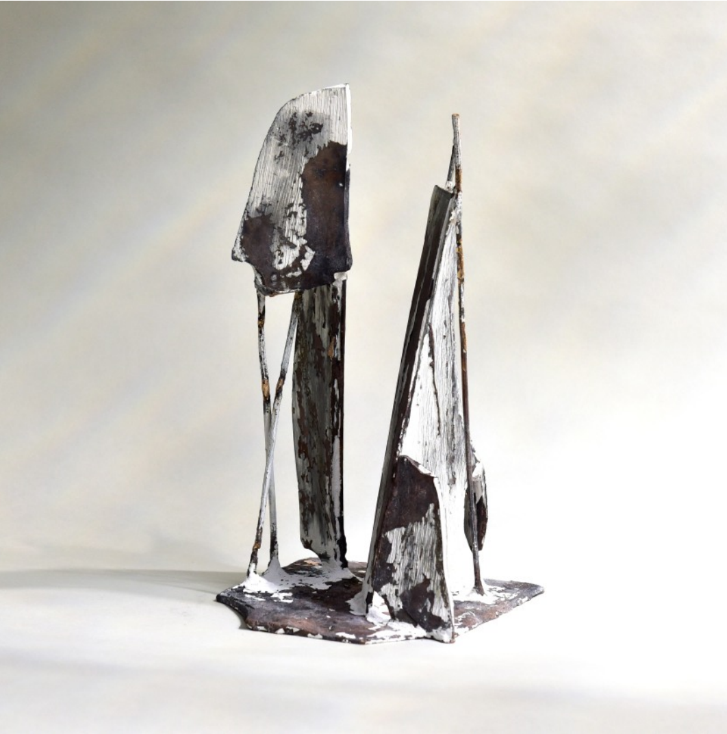
Verticales V. 2016 Bronce 16,5 x 18,5 x 29,5 cm