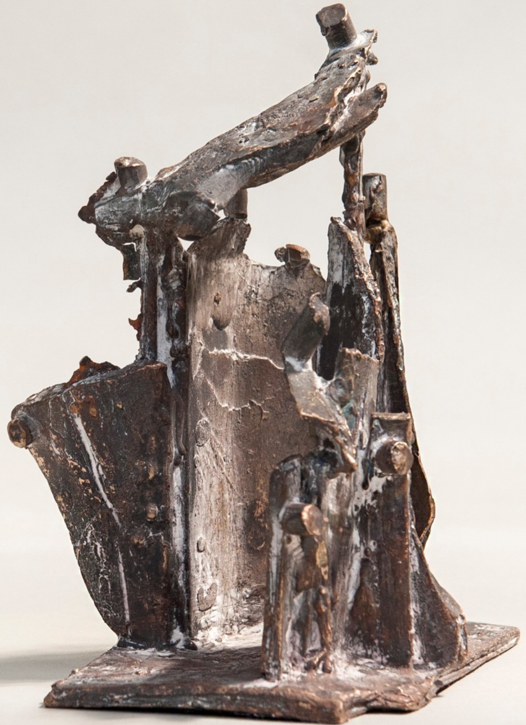
Puertas II. 2014 Bronce 9,5 x 13 x 18 cm