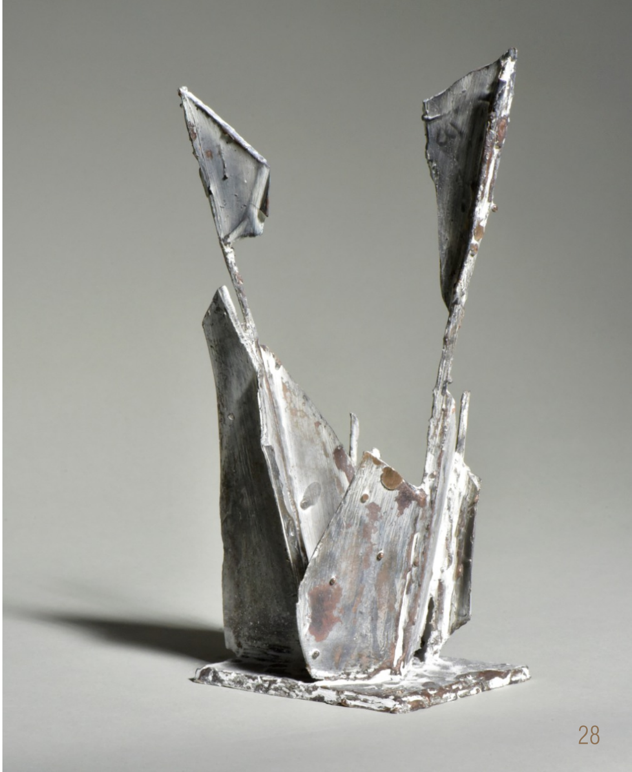
Verticales III. 2016 Bronce 15 x 10 x 25 cm