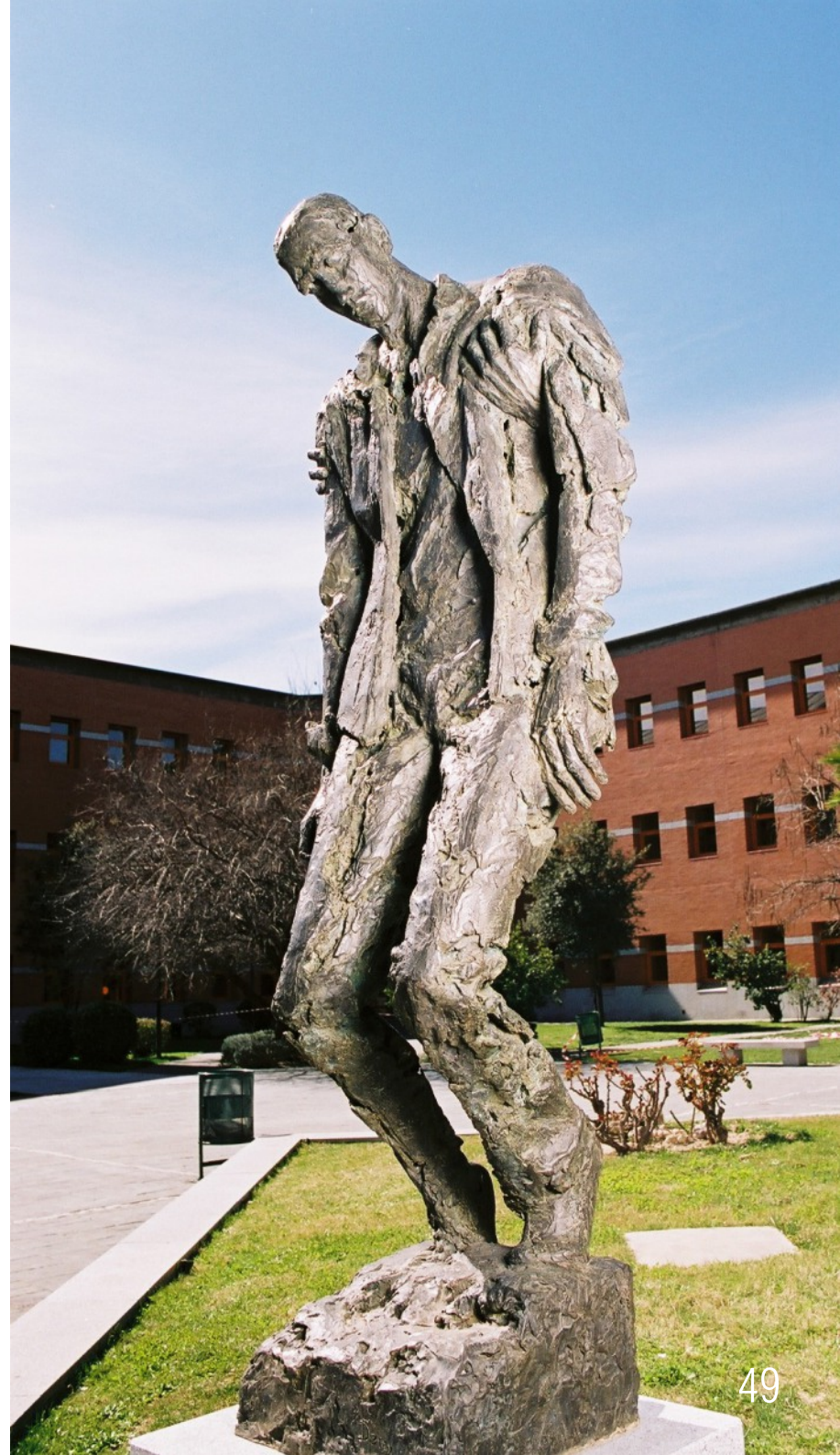
2006 Monumento a las Víctimas del Terrorismo. 2m. Bronce. Universidad Rey Juan Carlos. Vicálvaro. Madrid.