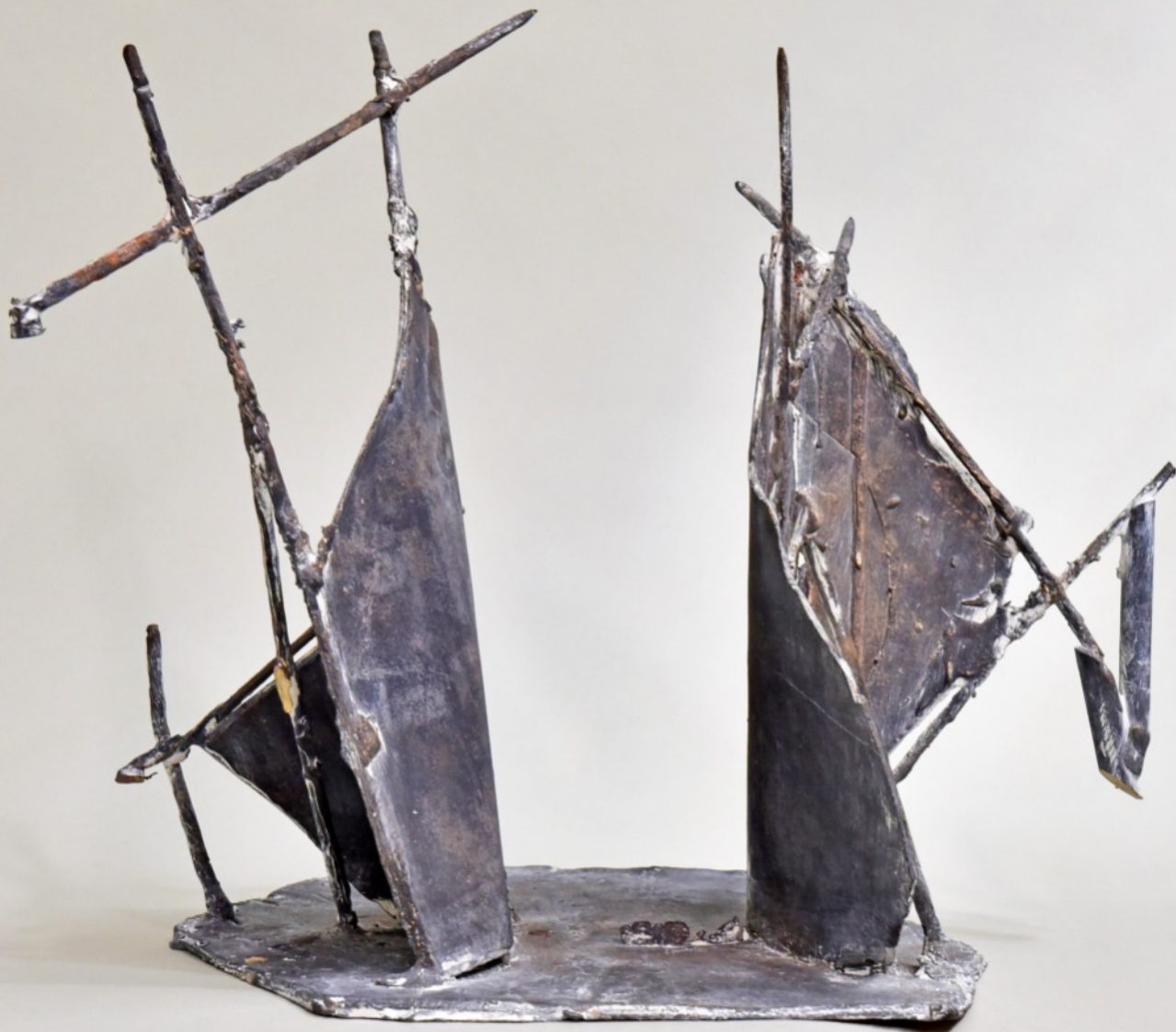
Verticales VII. 2017. Bronce 30 x 18 x 25 cm