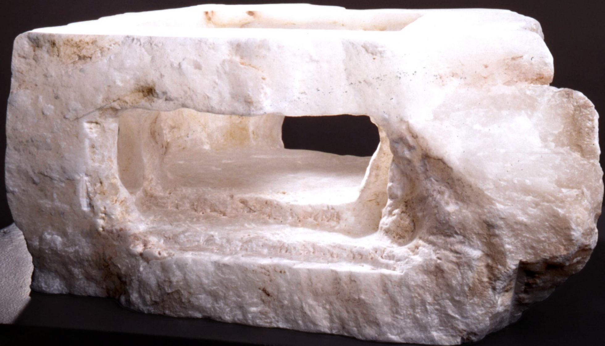
Atrio. 2001. Alabastro 46 x 43 x 22 cm