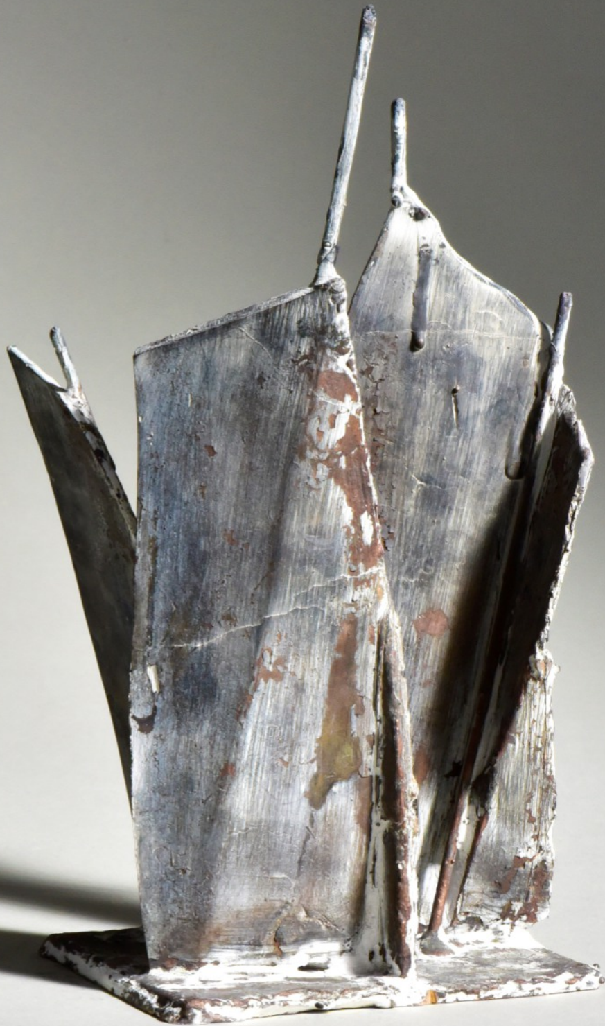
Verticales IV. 2016 Bronce 12 x 9,5 x 24 cm