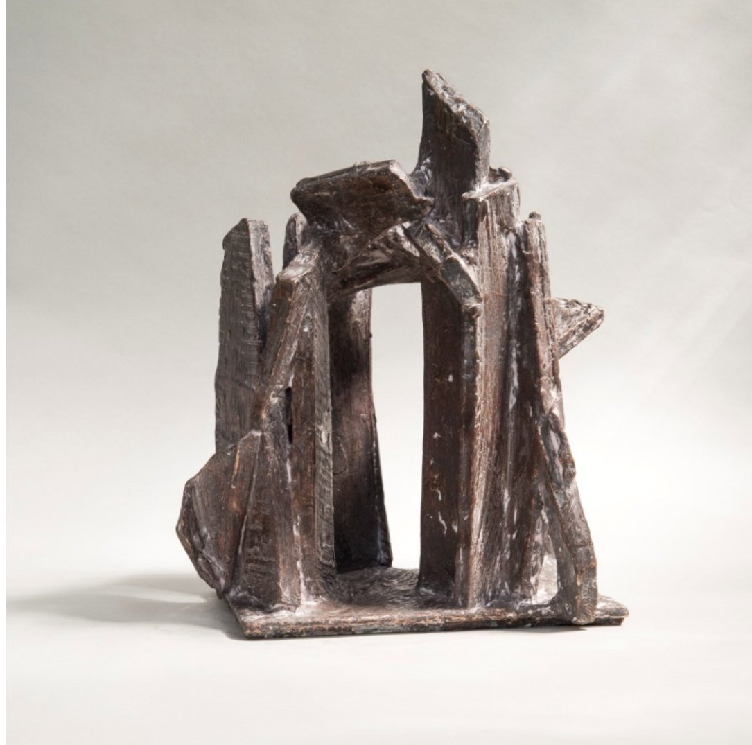
Puertas VII. 2014 Bronce 29,5 x 23 x 37 cm