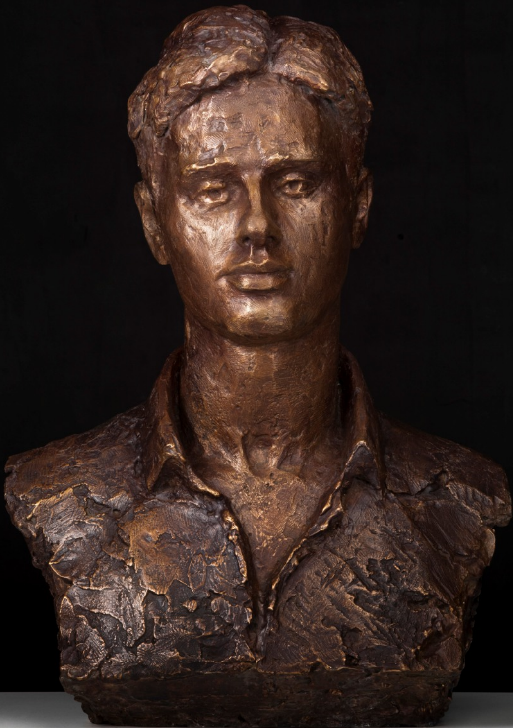
Monumento homenaje a Miguel Ángel Blanco. 70 cm. Bronce 2010 Ayuntamiento de Ermua (Vizcaya) 2014 Parque de Miguel Ángel Blanco. Chamartín. Madrid