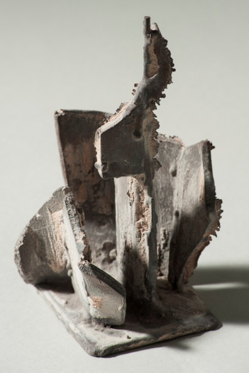
Passaggi II. 2011. Bronze 8,5 x 8 x 15 cm