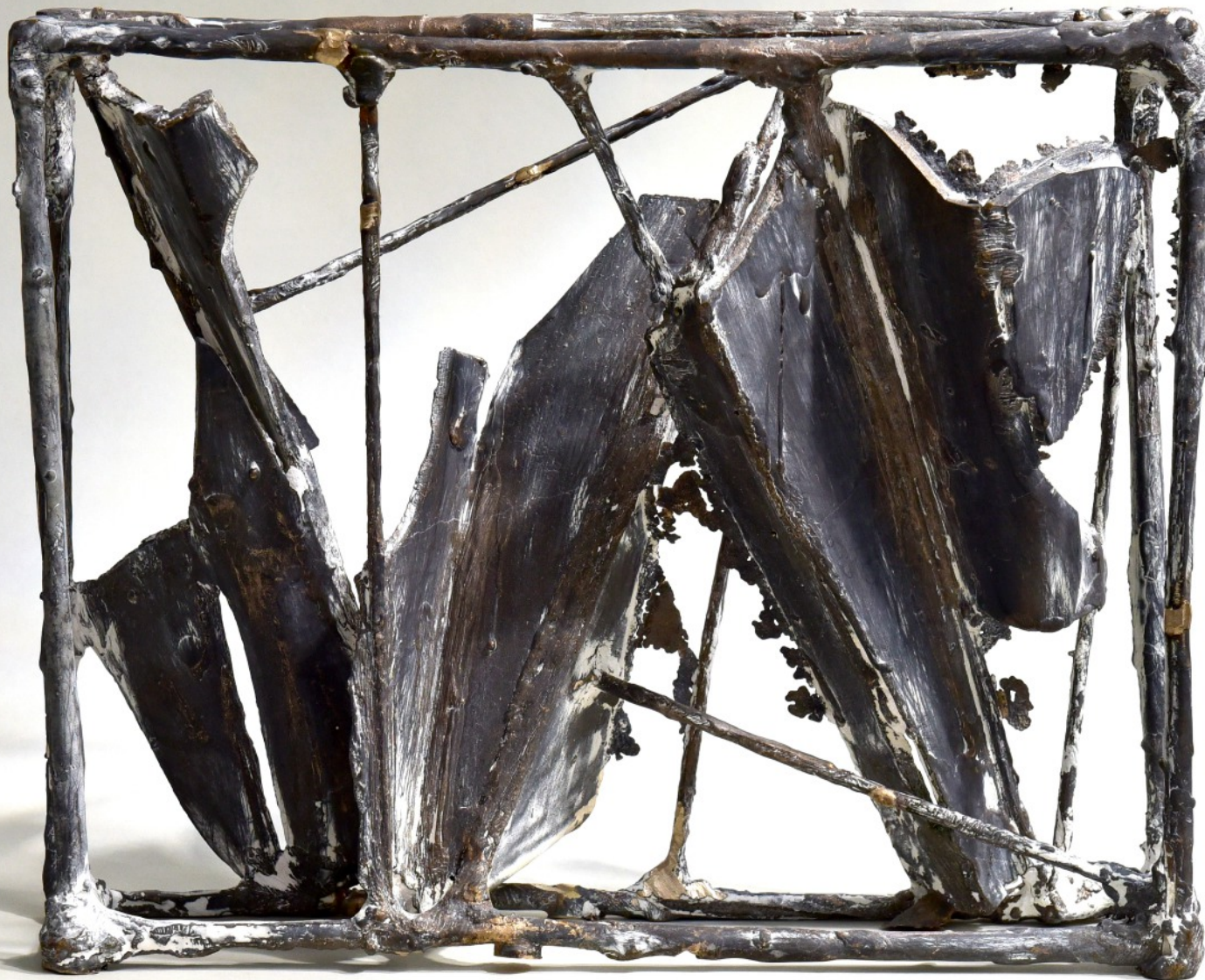
Relieve II. 2017 Bronze 27 x 7 x 22 cm