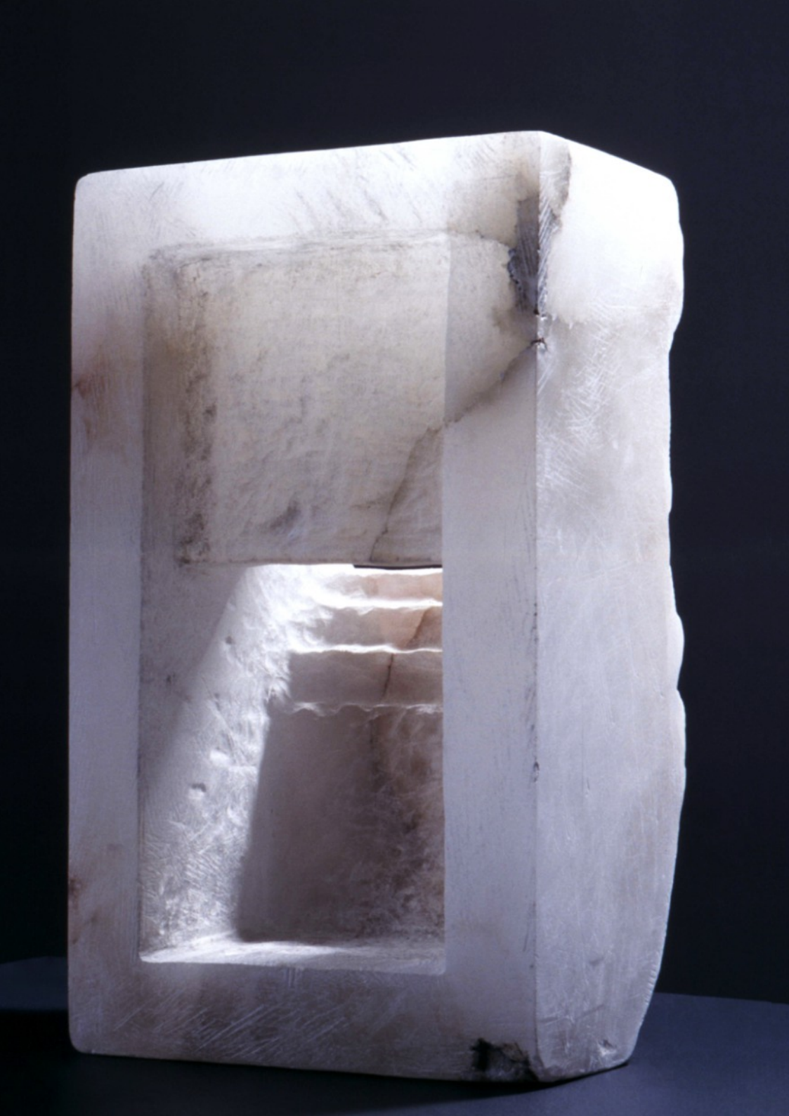
Ascenso. 2001. Alabastro 29 x 19 x 37 cm