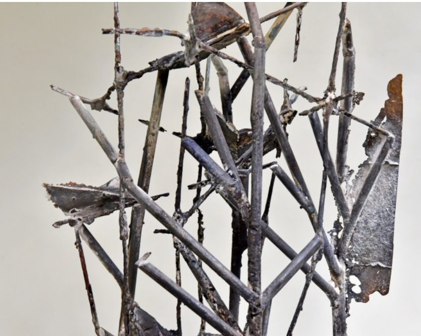
Vuelos III. 2017 Bronce 22 x 20 x 65 cm