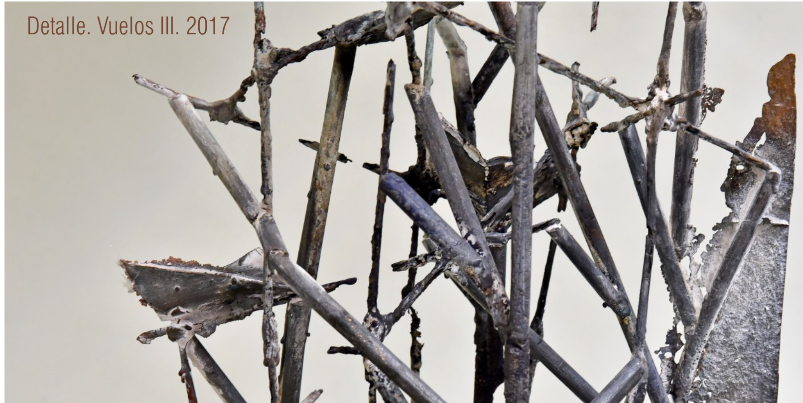
Detalle. Vuelos III. 2017

A sculpture that reflects the spirit and communicates to the viewer what has deeply moved me.