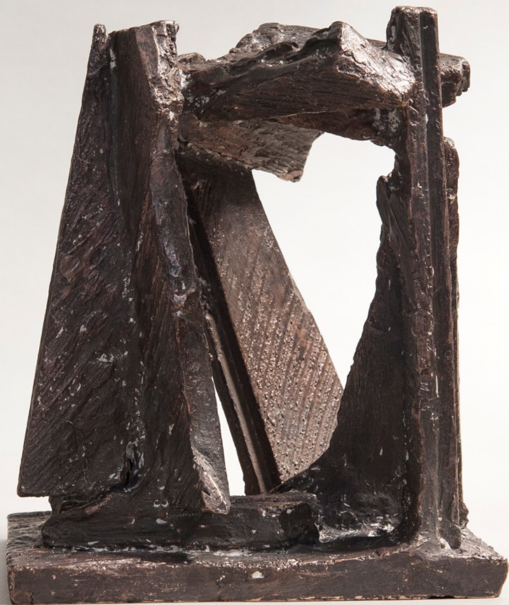
Puertas VIII. 2014 Bronce 19 x 17 x 23,5 cm