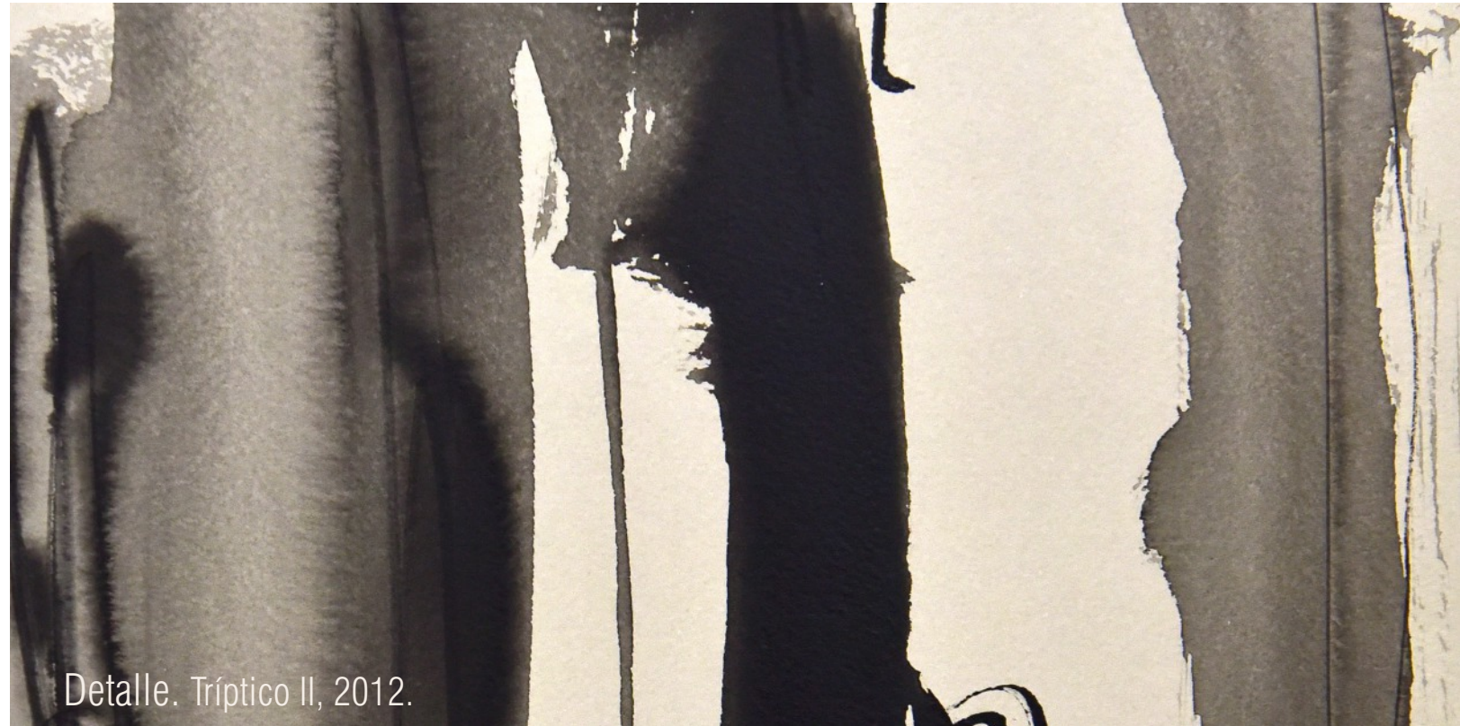
Detalle. Tríptico II, 2012.

Aesthetic experiences that I later translate into sculpture, filled with light and expressed through alabaster and